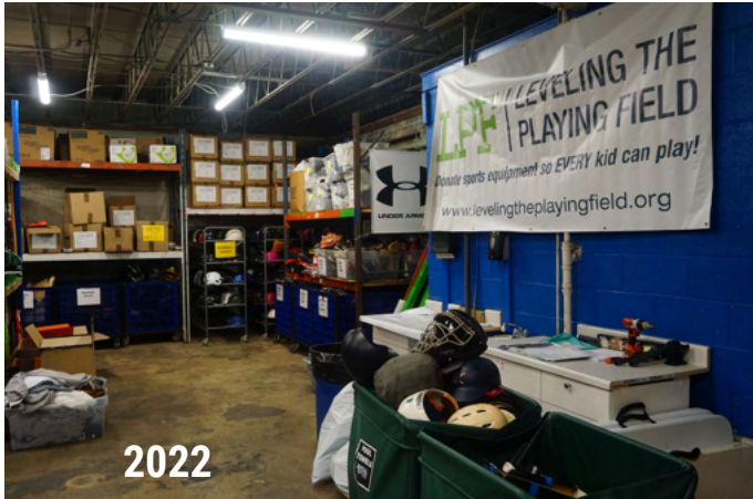
📍 Brookville Road